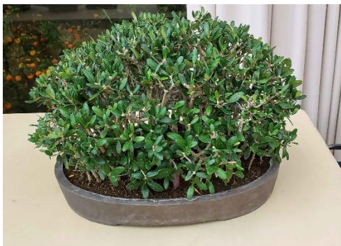
Mike Cullen – Olive grove

Several folks brought in trees destined for the show. Gordon critiqued each with suggestions on cleanup and redesigning the tree to show better.