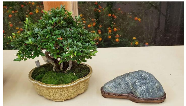
Bob Gould – Azalea and viewing stone

Several folks brought in trees destined for the show. Gordon critiqued each with suggestions on cleanup and redesigning the tree to show better.